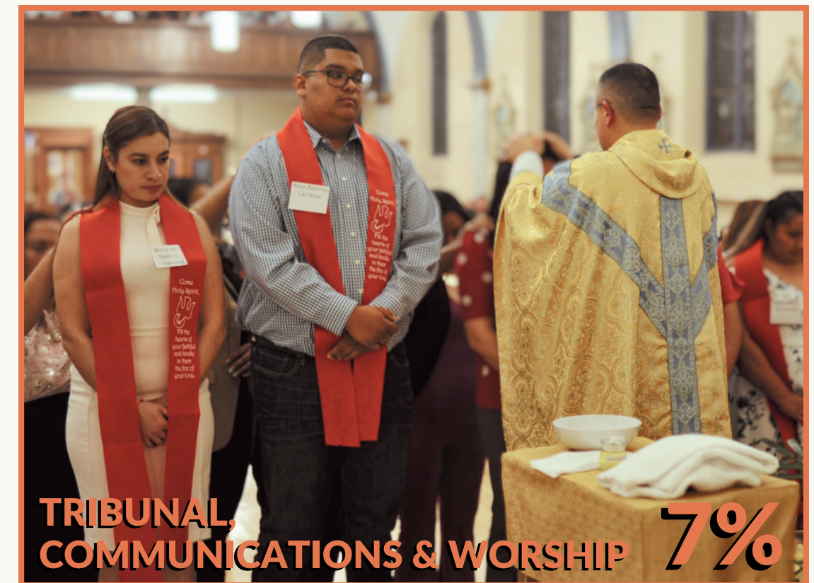
TRIBUNAL, COMMUNICATIONS & WORSHIP 7%