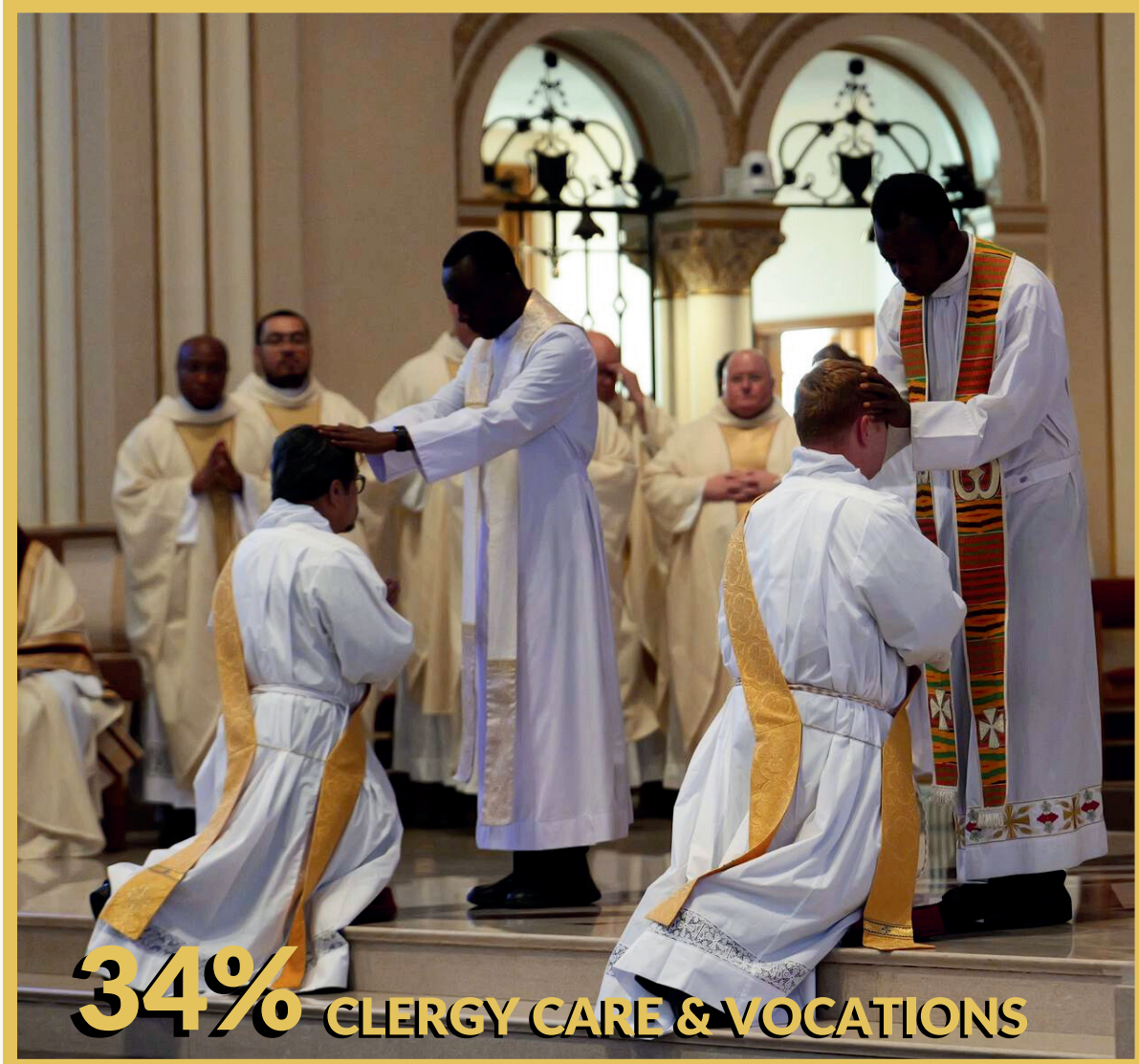
34% CLERGY CARE & VOCATIONS

Thank you for giving generously! The ADA provides more than 70% of funding needed to support our 80 parishes of Southwest Iowa. Our Diocesan goal is $5.093 million. Below is a snapshot of where these funds are put to work.