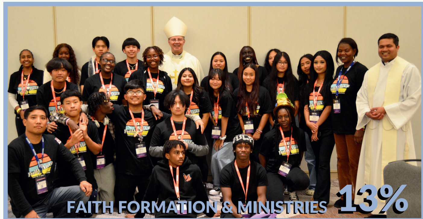
FAITH FORMATION & MINISTRIES 13%