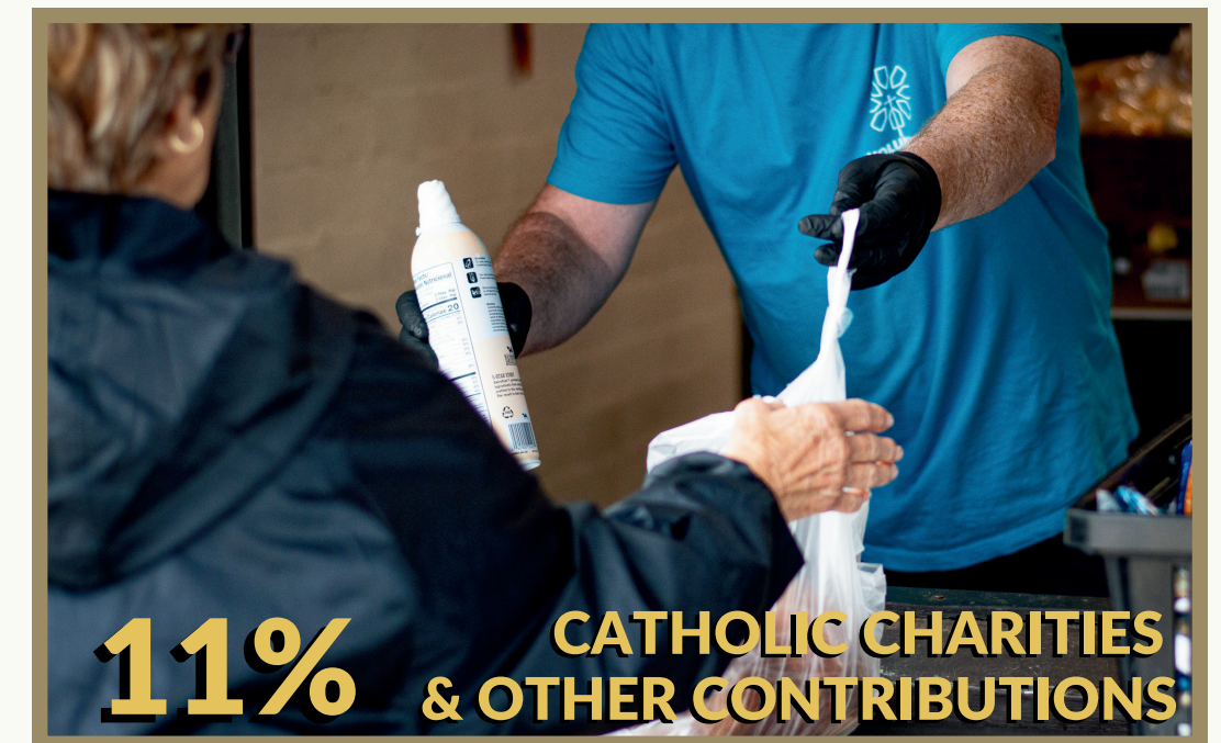
11% CATHOLIC CHARITIES & OTHER CONTRIBUTIONS

Please make a donation by scanning the QR code or visit DMDIOCESE.ORG/GIVING