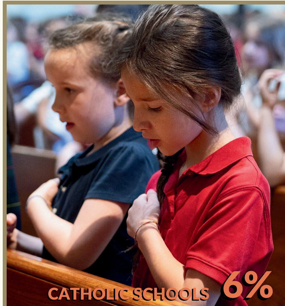
CATHOLIC SCHOOLS 6%