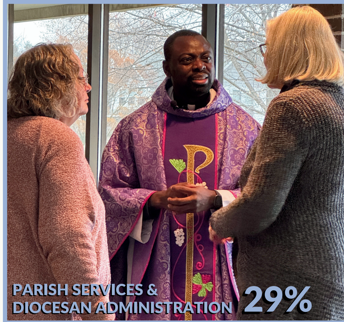
PARISH SERVICES & DIOCESAN ADMINISTRATION 29%